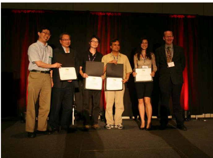
Poster Presentation Awards winners