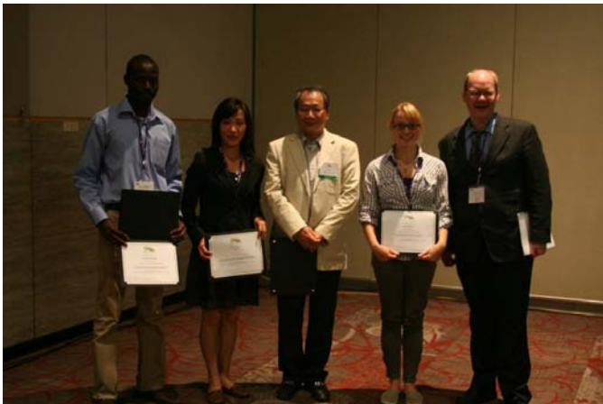
Oral Presentation Awards winners